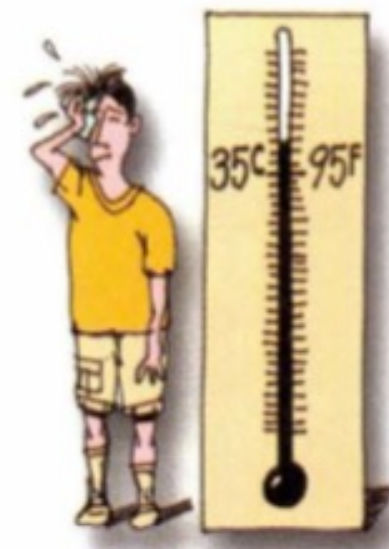
6 It's hot.