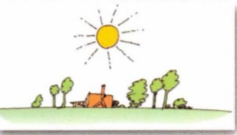
1 It's sunny.