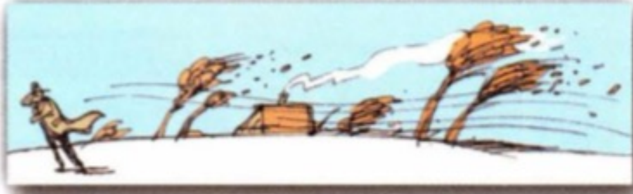
3 It's windy.