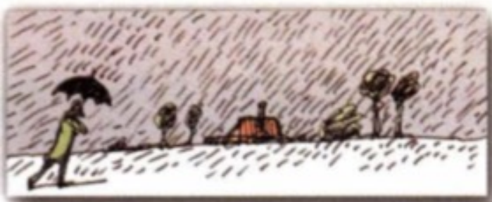
4 It's raining.