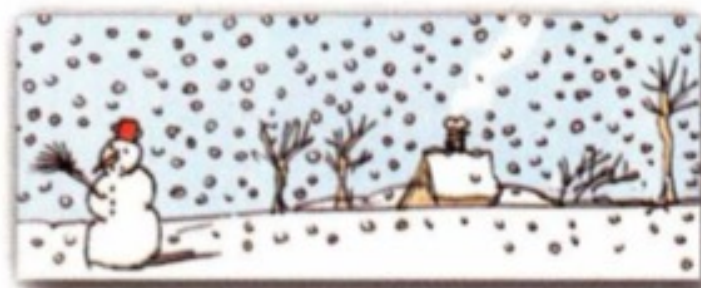
5 It's snowing.