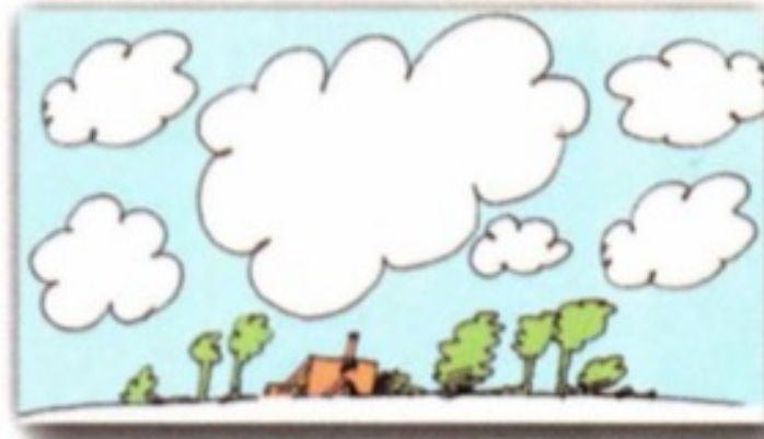
2 It's cloudy.