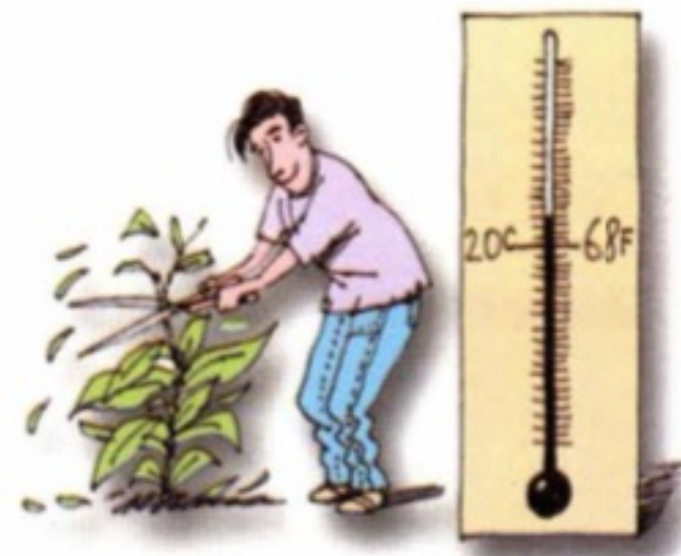
8 It's warm.