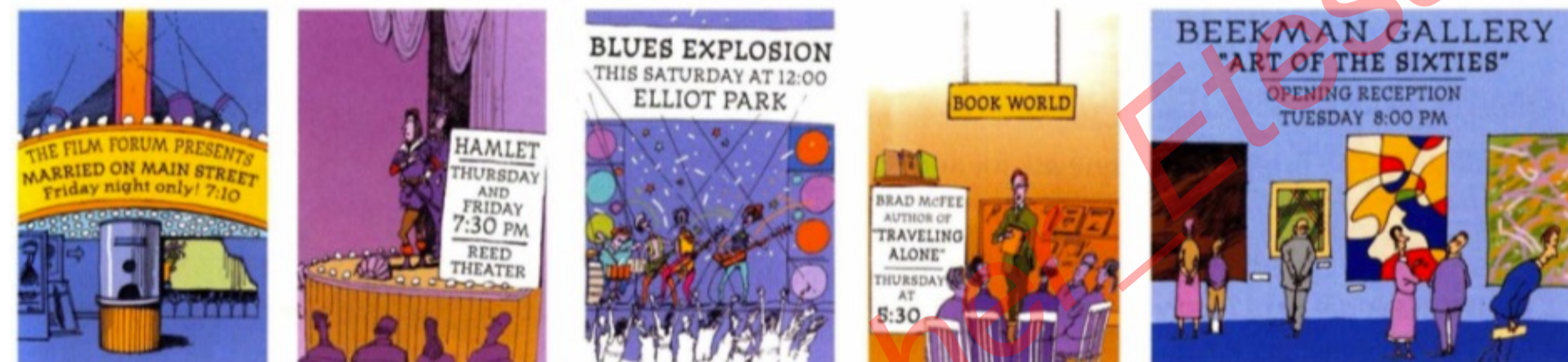
a movie / a film a play a concert a talk / a lecture an art exhibit

A ▶ 1:22 Read and listen. Then listen again and repeat.